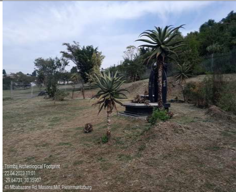
Figure 4: View of some of the heroes' burials