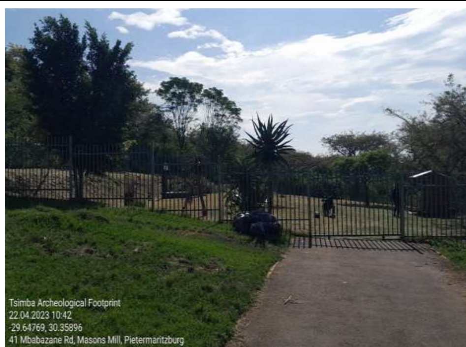
Figure 2: View of the Heroes' Acre entrance