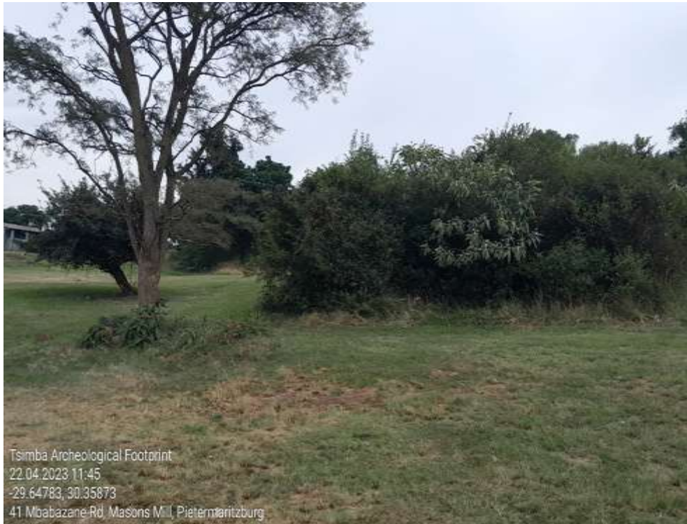
Figure 6: View of the outside of the heroes' acre.