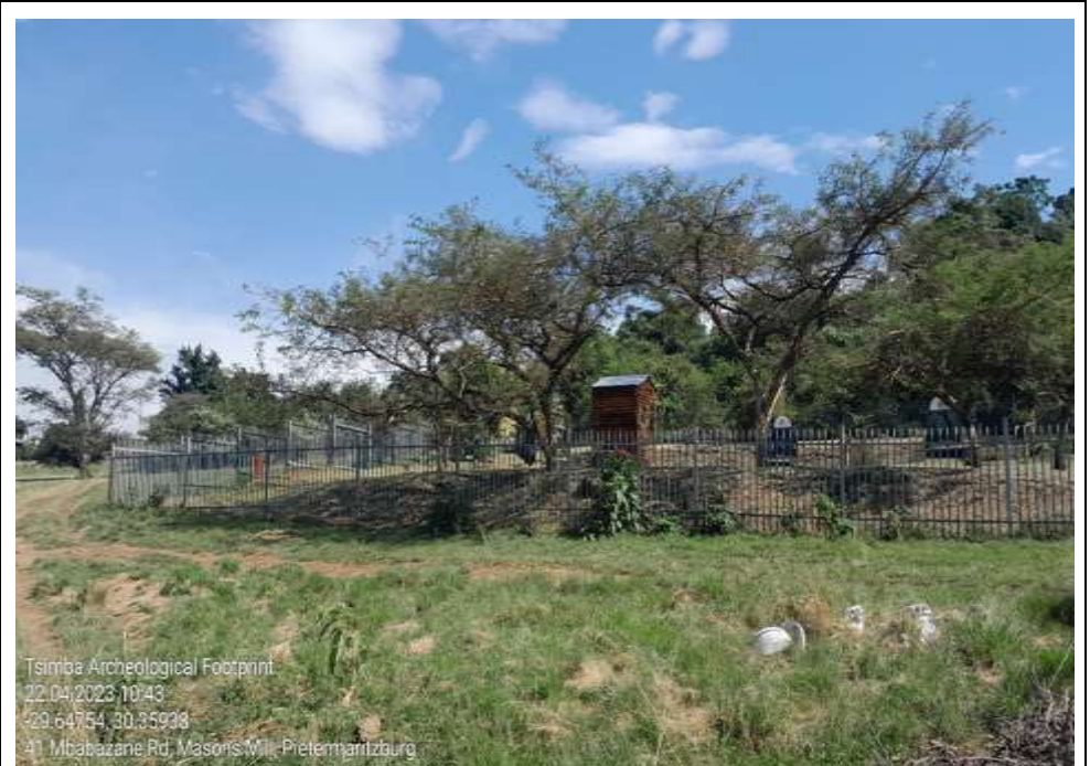
Figure 3: View of an access road on site