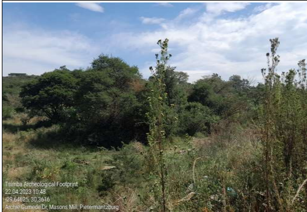
Figure 8:View of some vegetation cover just outside the site