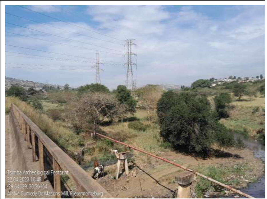
Figure 9:View of the Bridge on Archie Gumede Drive