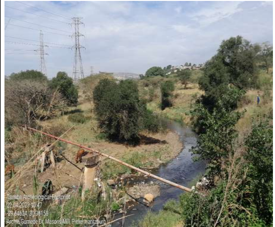
Figure 7: View of a water course stream outside the heroes' acre