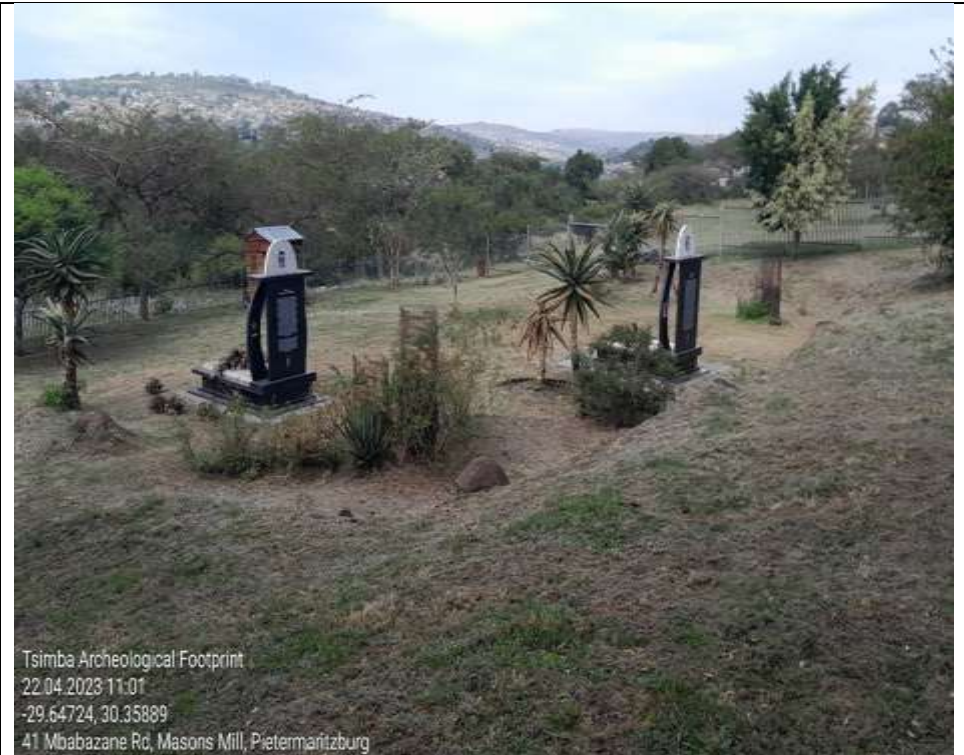
Figure 5: Another view of the heroes' burials